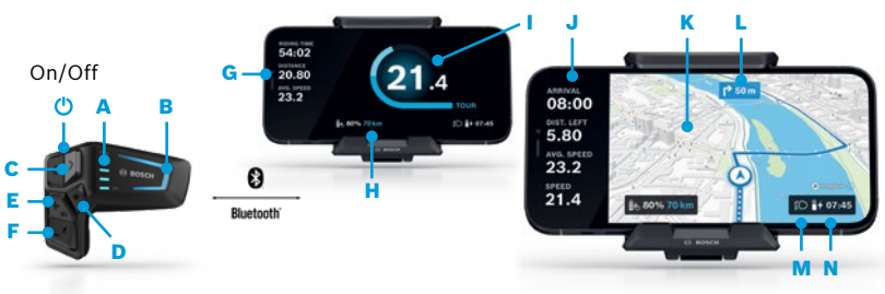
Maps @Mapbox @OpenStreetMap